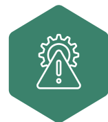
Risk Management & Compliance Committee (RMCC)