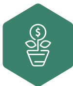
Investment Committee (IC)