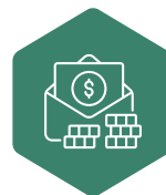
Nomination & Remuneration Committee (NRC)