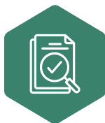
Audit Committee (IAC)